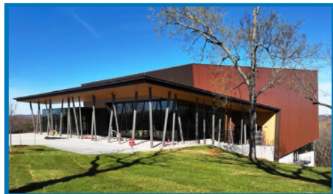
Inspiration Point Center for the Arts